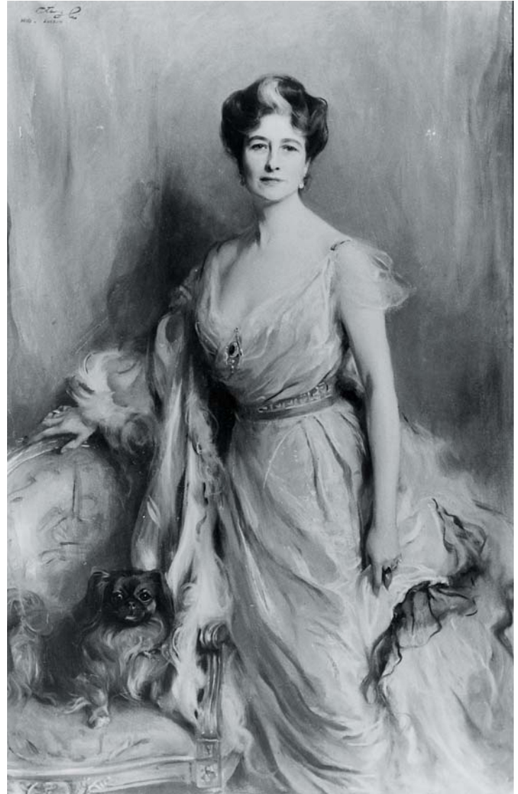
FIG. 10 Philip Alexius de László Lady Wernher Oil on canvas, 175.3 × 111.8 cm Private Collection