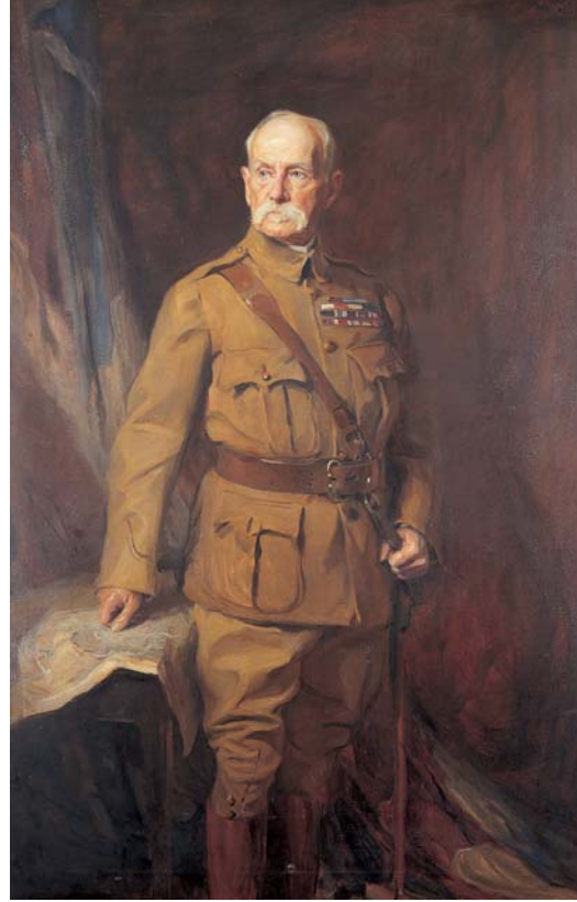
FIG. 5 (right) Philip Alexius de László Field Marshal Earl Roberts of Kandahar , 1911 Oil on canvas, 172.8 × 113.7 cm Eton College, Windsor

exception to his portrait embargo in agreeing to paint Randall Davidson, Archbishop of Canterbury, in 1910 for Lambeth Palace (fig. 2), because they had met in the Alps and were friends. Sargent's portrait of Davidson in his surplice and robes draws on the traditional imagery reserved for princes of the church, but plays it in a minor key. We see this modest and conscientious churchman in the private setting of his study with a jumble of books and documents on the table beside him. De László's 1926 full-length of the Archbishop for Church House, London (fig. 3) draws on the same iconographical conventions as Sargent does, but goes for the full panoply of ecclesiastical splendour and symbol. The Gothic throne on which Davidson sits had been used by him at the coronations of Edward VII and George V, and it invests him with the aura of authority as leader of the Church. He holds a book on his knee and his crozier stands beside the throne. De László records the nervousness of the Archbishop when shown the preliminary sketches because he feared the picture would be thought too artificial and 'showy'. Interestingly, de László hides Davidson's Garter Star in the fold of the vestments, exactly as Sargent had done sixteen years earlier.