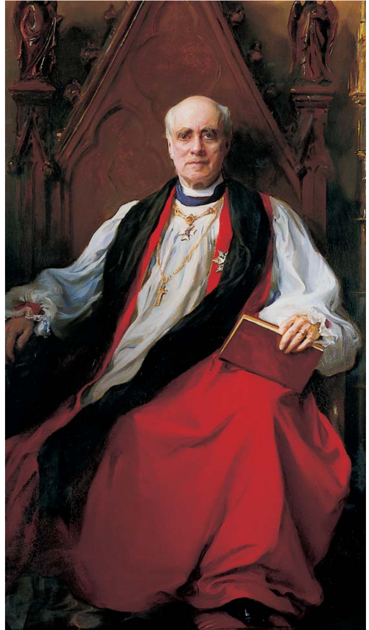
LEFT FIG. 2 John Singer Sargent 1856 - 1925 Randall Davidson, Archbishop of Canterbury , 1910 Oil on canvas, 130.8 × 105.4 cm Lambeth Palace, London

In painting the great and the good of the British establishment, Sargent and de László adopted strategies that point up the similarities and differences that distinguish their portraits. Sargent had made a