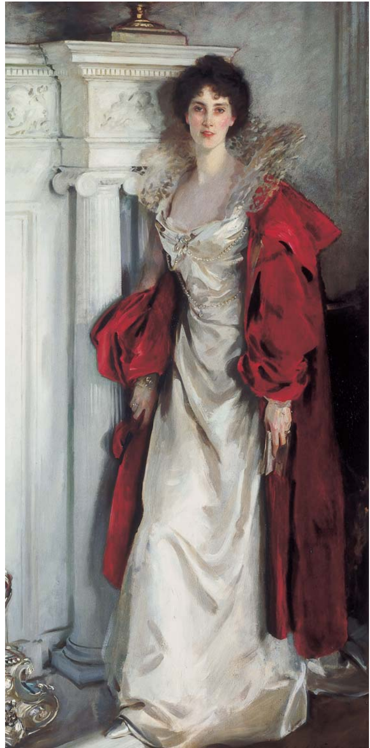
FIG. 8 John Singer Sargent, The Duchess of Portland , 1902 Oil on canvas, 228.6 × 111.8 cm. Private Collection

Comparison of the female portraits is particularly instructive, because it is as painters of women that both artists are best known. A decade or more invariably separates their respective portraits of the same sitter, Sargent painting them as young or young middle-aged, de László as mature matrons. Winifred, Duchess of Portland, one of the great beauties of the age, was painted by Sargent in 1902, when she was thirty nine, though you would never guess that from Sargent's youthful-looking image (fig. 8). Dressed in a white evening gown with stand-up Van Dyck collar, cerise cape, and strings of pearls draped across her corsage, she stands perched momentarily on the edge of the marble fireplace in the Gobelin Tapestry room at Welbeck Abbey, the Portland family home. She is a mixture of nervous vitality, high breeding and aristocratic grandeur. De László's three-quarter length portrait (fig. 9), painted exactly ten years later, just recently traced, is a more stately and reflective image, showing the Duchess seated and gazing into space, lips parted, as if in thought. She is again dressed in evening gown and cape, and she fingers a pearl necklace in one hand like a rosary, with a classical fillet of leaves in her hair. She is still stunningly beautiful at fifty, and de László grasps the essence of her radiant personality in one of his most accomplished works. Other portraits of the Duchess were to