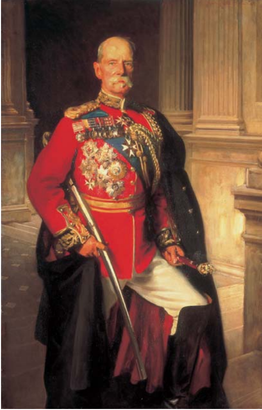
FIG. 4 (left) John Singer Sargent Field Marshal Earl Roberts of Kandahar , 1908 Oil on canvas, 161.9 × 102.9 cm National Portrait Gallery, London