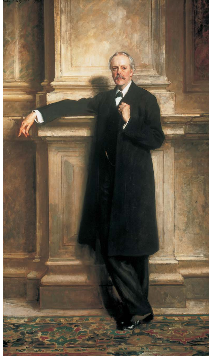
FIG. 7 John Singer Sargent Arthur James Balfour, 1908 Oil on canvas, 256.5 × 147.3 cm National Portrait Gallery, London

Another of the dominating political figures of the age painted by both artists was A.J. Balfour, conservative Prime Minister,