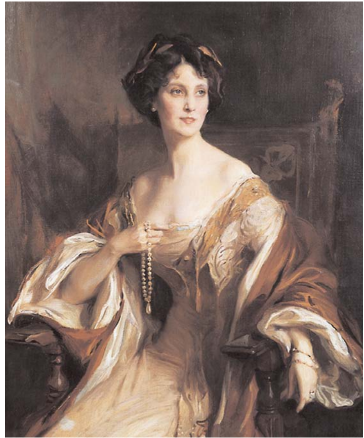
FIG. 1 Philip Alexius de László 1869 - 1937 The Duchess of Portland 1912 Oil on canvas, 127 × 101.5 cm Private Collection

Sargent's career had not always been marked by effortless success. The son of expatriate American parents, he had been born and brought up in Europe, and he had trained as a painter in the atelier of the fashionable French portrait painter Emile Carolus-Duran. Early successes at the Paris Salon with portraits and subject pictures